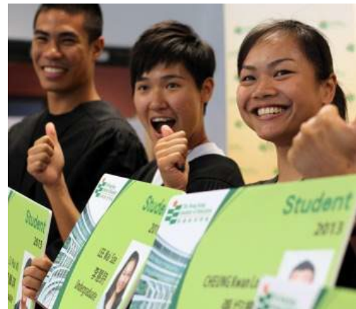
精英運動員學習計劃合作備忘錄簽署儀式 MOU Signing Ceremony for Elite Athletes Study Programme